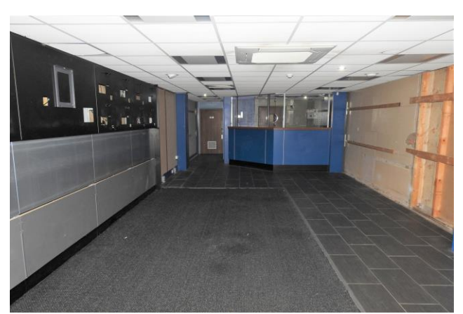
London Road North Lowestoft NR32 1NB

696 sq ft/64.7 sq m Lock Up Shop: including open plan shop/office space, secure internal office, small kitchen area, disable toilet and further W.C. The property is available on a new full repairing and insuring lease with flexible terms to be agreed.